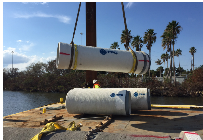
▲ BEVEL ADAPTER IS PRE-ASSEMBLED ON LENGTH OF PCCP