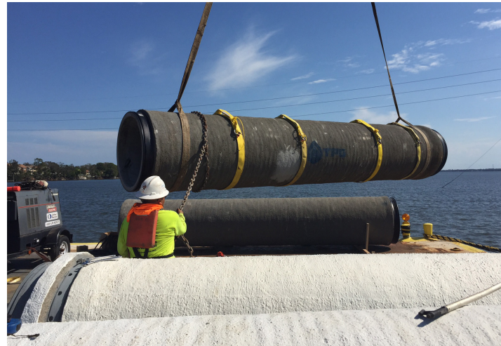
▲ 20-FOOT LENGTH OF PCCP IS LIFTED FROM THE BARGE

The 80-foot length of PCCP was installed without incident and full capacity was restored by replacement of the dislodged pipe less than one month after the break was discovered. All risk of pollution to the water supply was successfully averted.