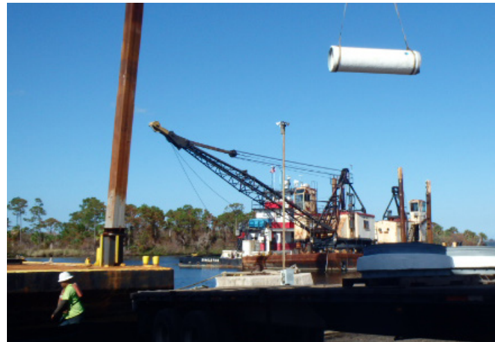
▲ SECTION OF 36" PCCP IS HOISTED INTO POSITION